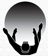
NIGHT VIEW HEADLAMP